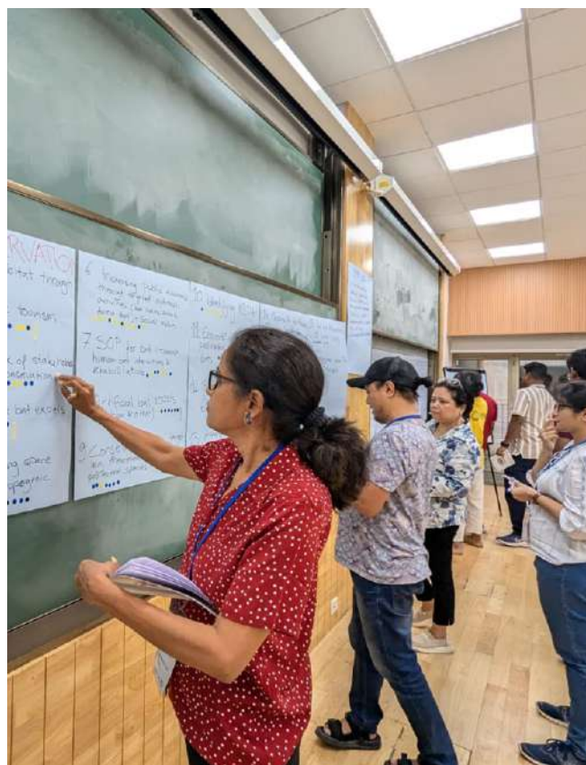
Report contributors voting for the top 10 research and conservation priorities at SoIBats Workshop in Bengaluru.

Among the CAMP report's conservation recommendations, the critical need for wide-reaching public awareness campaigns and the removal of fruit bats from the vermin list in Schedule V of the Wild Life (Protection) Act, 1972 stood out [43] . The report also emphasised the need to protect roosting sites and other important habitats of threatened bat species through government policies. The Archaeological Survey of India (ASI) was identified as a key stakeholder in this regard. The report also explicitly highlighted the needs to include