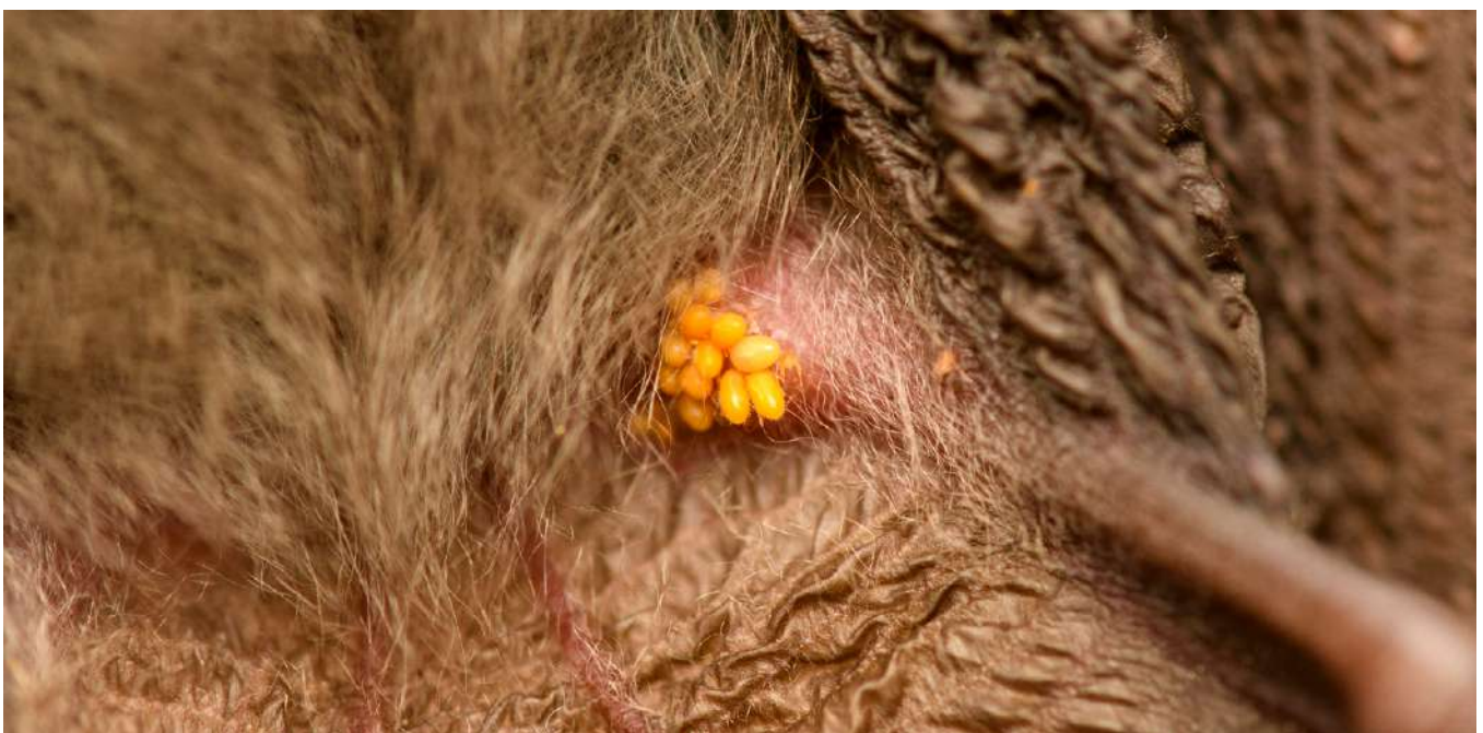
Fly eggs on a bat. Investigating bat ectoparasites (such as these flies), endoparasites, and pathogens is among the top research priorities identified by the State of India's Bats team.

6. Investigating the pathogen diversity in Indian bats and potential disease interfaces. In the wake of consecutive Nipah virus outbreaks in India (specifically in Kerala) and the COVID-19 pandemic, we recommend that virologists, epidemiologists, and bat researchers collaborate to investigate the disease ecology of bats within a One Health framework. Epidemiological investigations into the potential causes of disease outbreaks can be hampered by a lack of understanding of bats and their disease ecology. Working collaboratively across disciplines can help mitigate this impediment and facilitate the design of more effective, disease-specific prevention measures to reduce future outbreaks for human and bat health (Chapter 8).