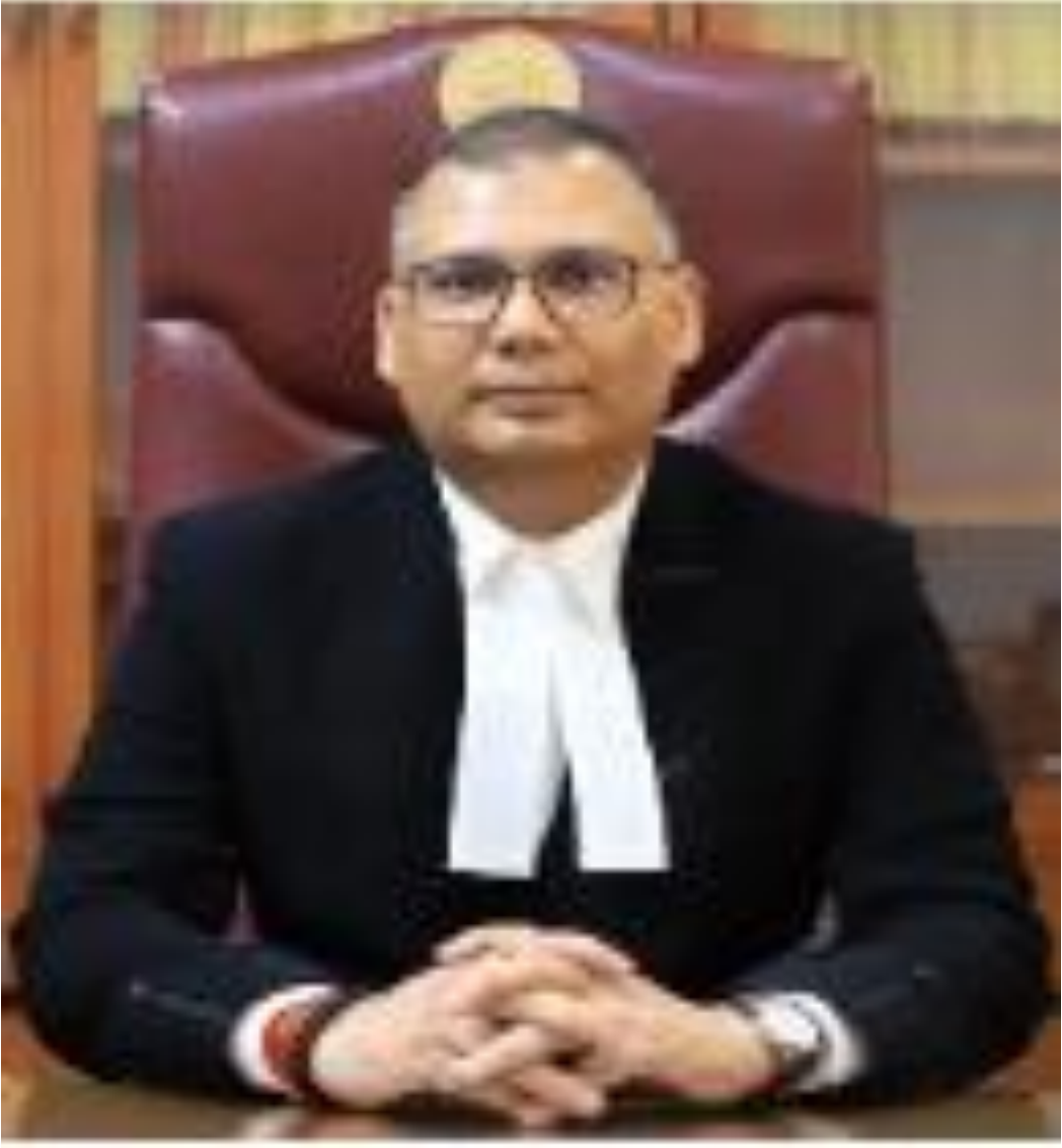
जस्टिस गौरांग कंठ (फाइल फोटो)